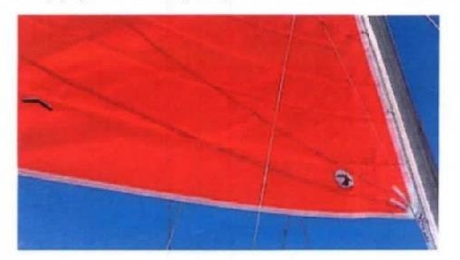
TRYSAIL OR REEFABLE MAINSAIL

Permanently installed marine magnetic steering compass, independent of any power supply, correctly adjusted with deviation card.