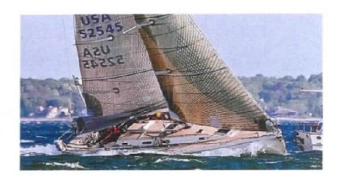
HEAVY WEATHER JIB

OSR reference 3.23 / 3.23.1 b) Bilge pump, manual, permanently installed, operable with all cockpit seats. Removable bilge pumps handle retained by lanyard.