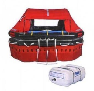
INFLATABLE LIFERAFTS OSR reference 4.20 / 4.20.1 One or more inflatable liferafts with a total capacity to accommodate at least the total number of people on board.