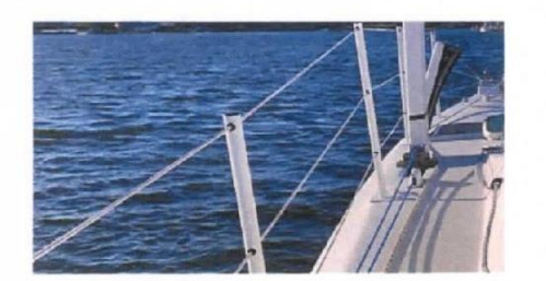
PULPITS, STANCHIONS and LIFELINES OSR reference 3.14.1 b) / 3.14.6 a) / 3.14.6

Either storm trysail with area ≤ 17.5% × P × E or mainsail reefing to reduce the luff by at least 40%.