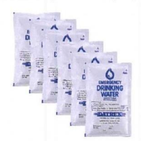
EMERGENCY DRINKING WATER

OSR reference 3.23.1 a) two strong buckets, each with a lanyard and of at least 9 I (2.4 US Gal) capacity.